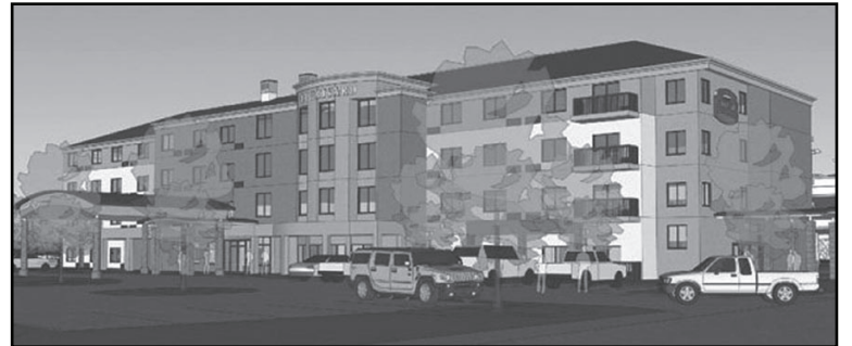
Hockersville Road Hotel site

DERRY TOWNSHIP, PA — Central PA Equities 13 LLC purchased six noncontiguous parcels from the Derry Township Industrial and Commercial Development Authority. The parcels are located on Hockersville Road, and Mill Street in Derry Town-